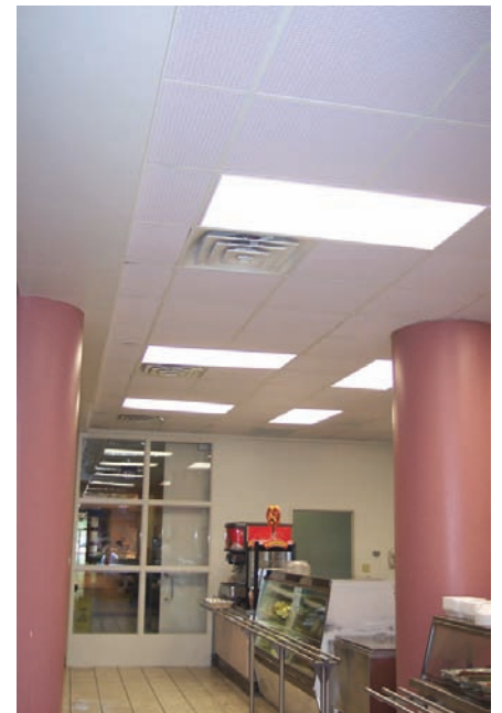
Fits standard lay-in ceiling grids, no clips necessary.

*Rating scale 10- Indicates a film totally absent of disfigurement by particulate matter.